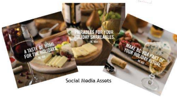
Social Media Assets