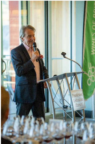
Steven Spurrier, Decanter Magazine

The Judgment of BC was once again curated and moderated by DJ Kearney, culminating in an industry dinner hosted at Poplar Grove Winery bringing member wineries together to taste, mingle and celebrate BC wine with our honorary guests and keynote speaker Steven Spurrier. The final Judgment of BC resulted in 65 articles generating $243,853 in unpaid media, reaching 26 million in circulation and earned a substantial 265 social media mentions with an online reach of more than 13,700 and 555,800 impressions.